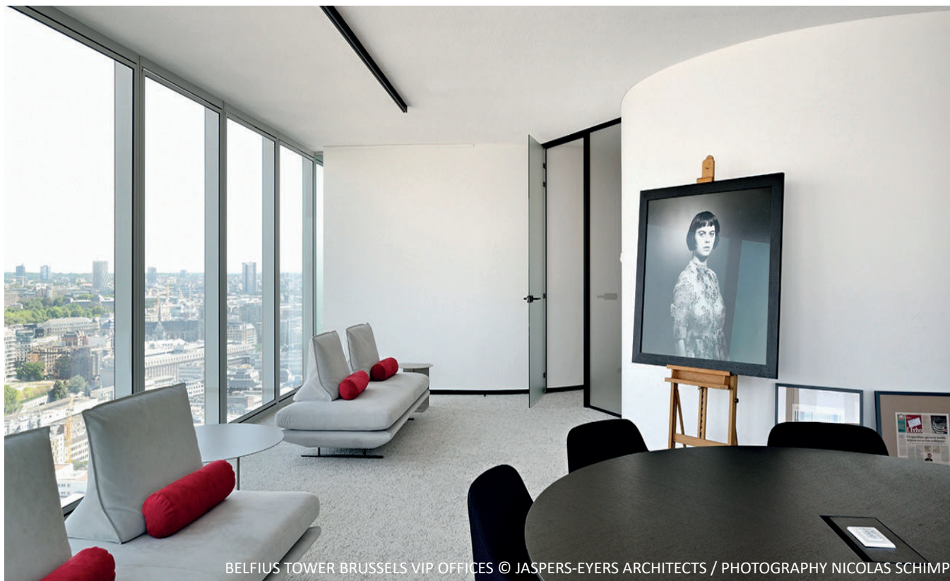
BELFIUS TOWER BRUSSELS VIP OFFICES © JASPERS-EYERS ARCHITECTS / PHOTOGRAPHY NICOLAS SCHIMP